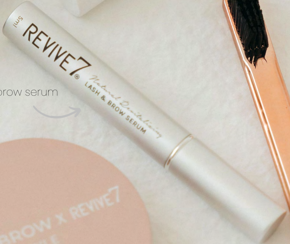
revive7 lash & brow serum