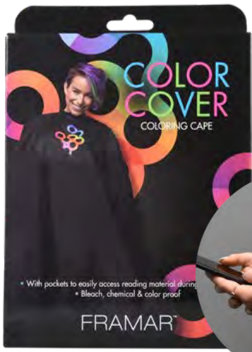
framamar colour cover.