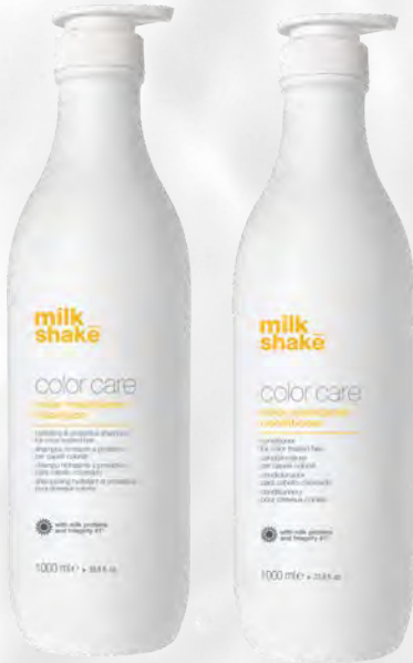
colour maintainer shampoo colour maintainer conditioner