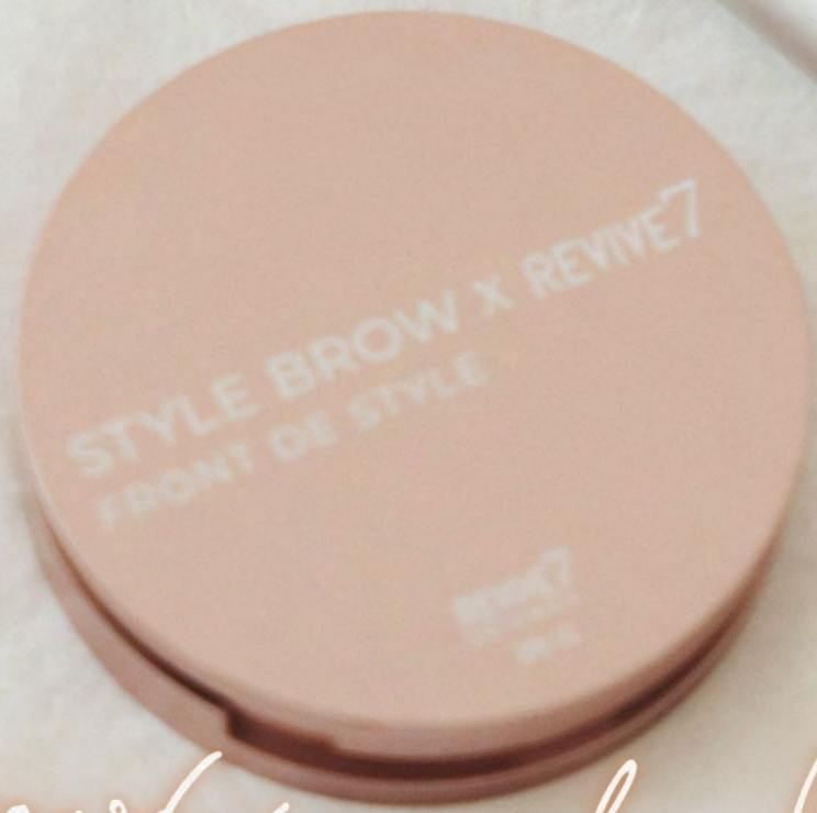
revive7 style brow