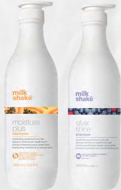
moisture plus shampoo silver shine shampoo