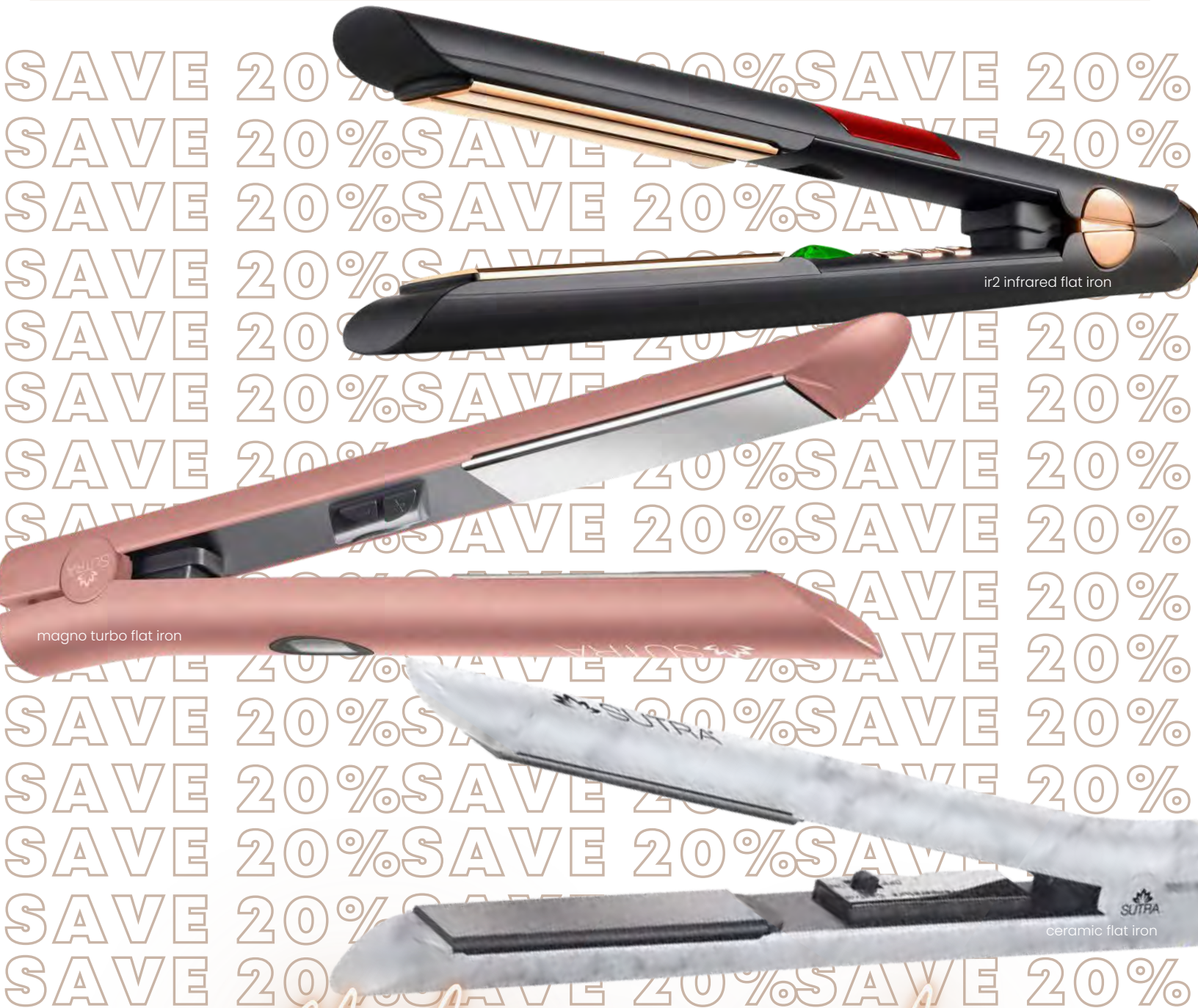
ir2 infrared flat iron