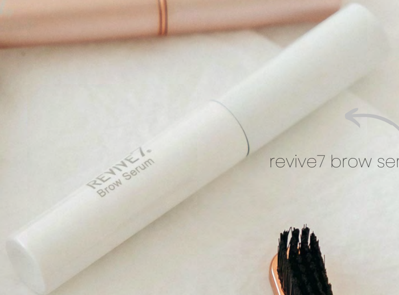
revive7 brow serum