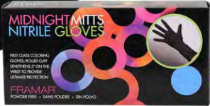
framamar midnight mitts gloves