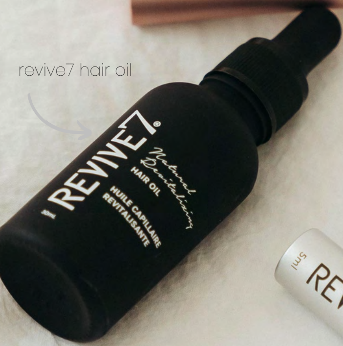
revive7 hair oil