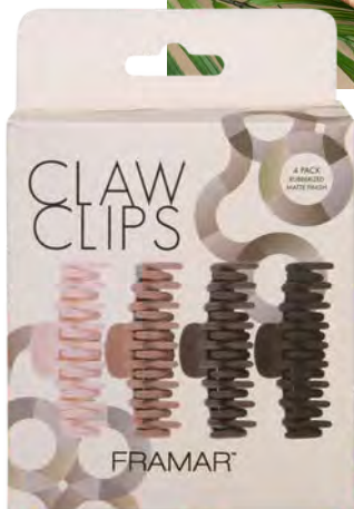
new. framamar claw clips neutral 4 pack